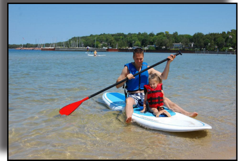
Egg Harbor Village Beach