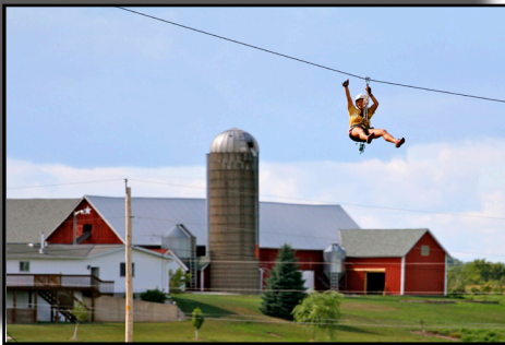
Team Leadership Center, Inc