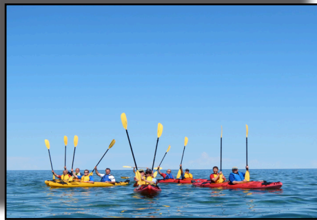
Rowleys Bay Resort